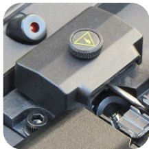
Simply exchange of electrodes