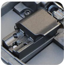
Changeable holder for multi-functional splicing