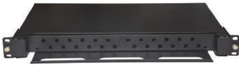
24port FC SX: OXIN-9530