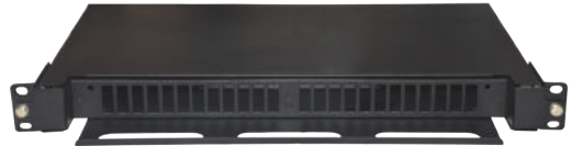
24port SC DX: OXIN-9520