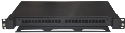
24port SC SX: OXIN-9550