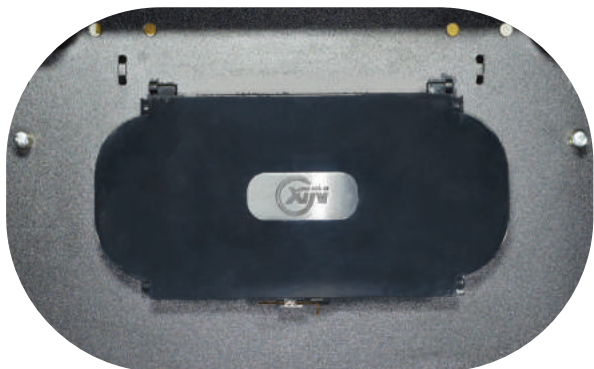
Big Splice Tray