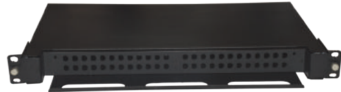
48port FC SX: OXIN-9540